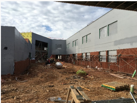
Brick Install at Courtyard