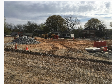
Preparing Parking Lot and Drive for Binder and Asphalt