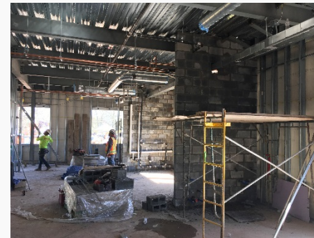
CMU Walls & MEP Installation at New Building