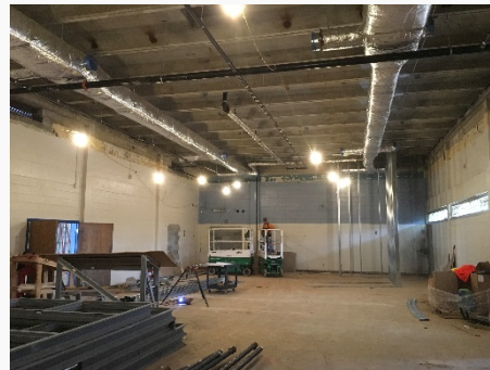
MEP Rough at Auditorium