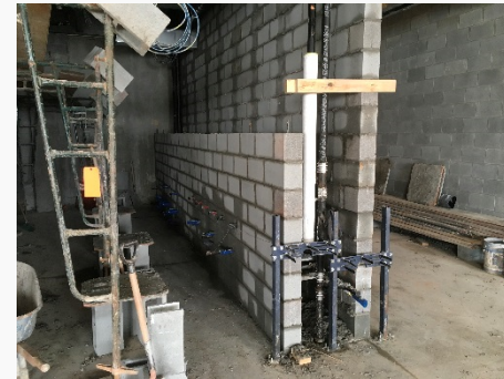
CMU Chase & Plumbing In-Wall