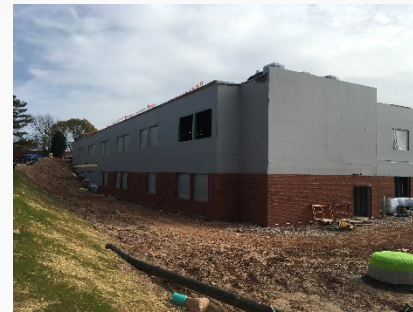
Exterior Framing, Sheathing, Air Barrier, & Brick