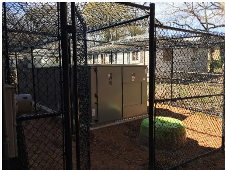
Fenced In AHU