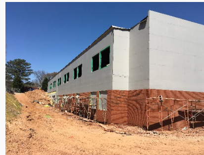
Exterior Framing, Sheathing, Air Barrier, & Brick