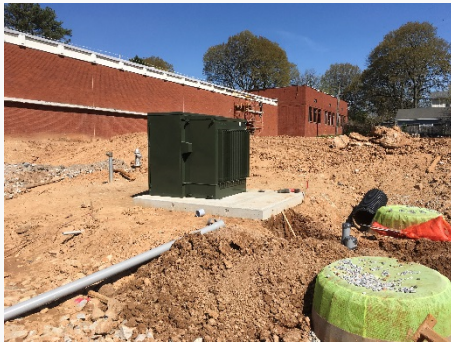
Main Electrical Transformer