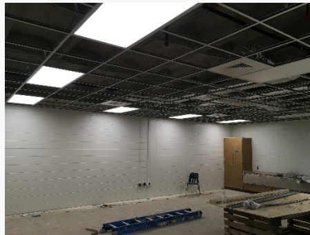
Lighting Installed at Renovation