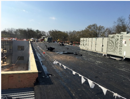
HVAC Units Set & Roofing Installation